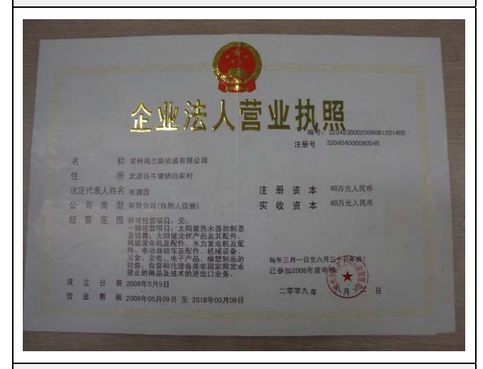
Certification & Photos -- Tax Registration Certificate

Certification & Photos -- Business License (Original)